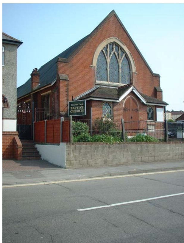
Bitterne Park Baptist Church, Wellington Road