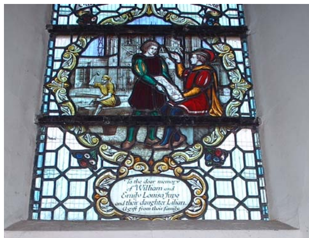
St Laurence Window, Church of the Ascension, Bitterne Park (detail)