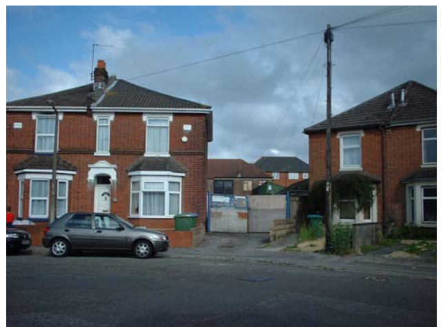
Fernlea, Station Road (now Macnaghten Road), Bitterne Park