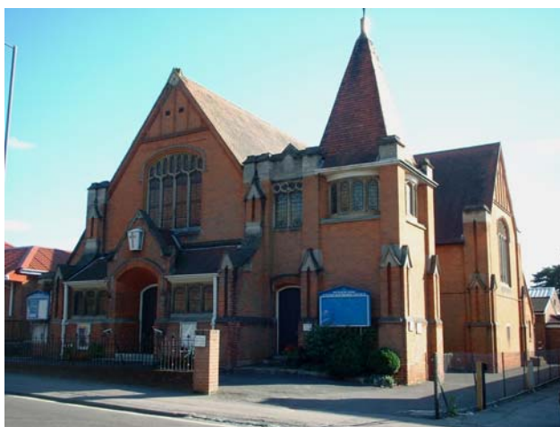
Bitterne Park Congregational Church, now United Reformed Church, Cobden Avenue

rooms, high ceilings and sash windows; they were built to last.